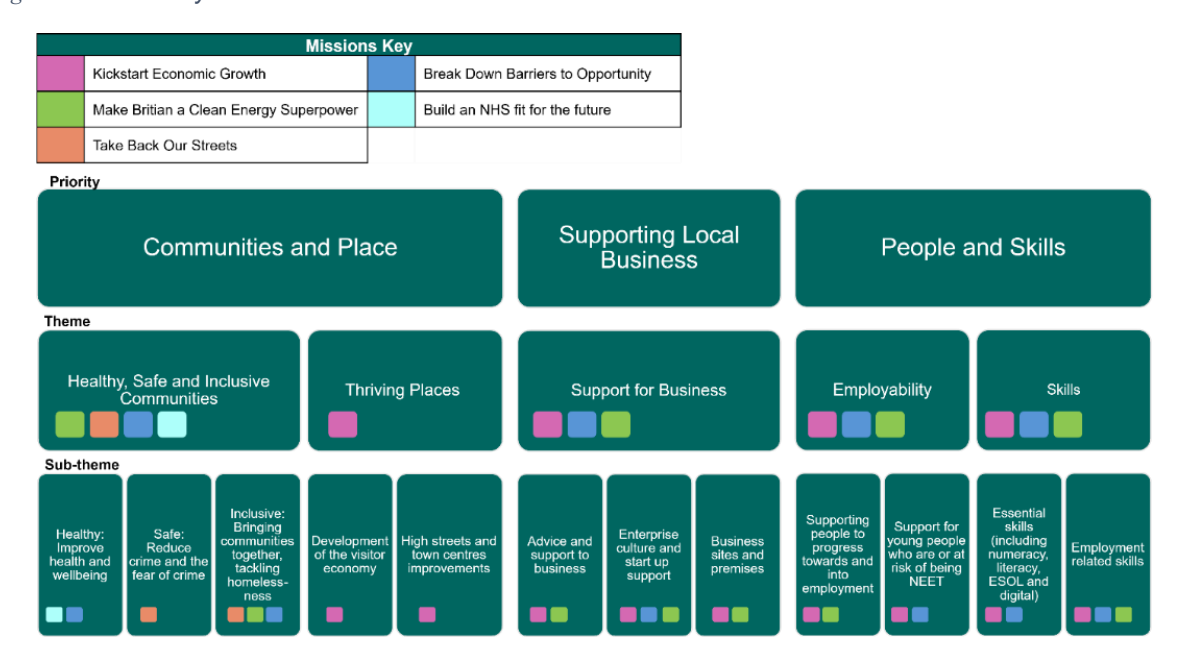
Figure 1 UKSPF Key Themes and Sub-themes

Source Paragraph 6: <u>UK Shared Prosperity Fund 2025-26: Technical note - GOV.UK</u>